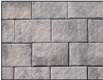
GRANITE CITY BLEND