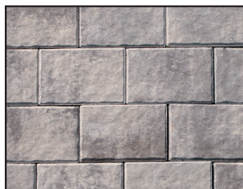
GRANITE CITY BLEND