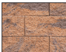
GOLDEN BROWN BLEND