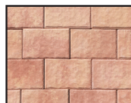
CRAB ORCHARD BLEND*