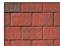
FIRE ISLAND BLEND