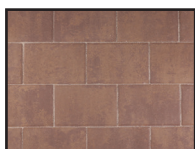
GOLDEN BROWN BLEND