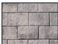
GRANITE CITY BLEND