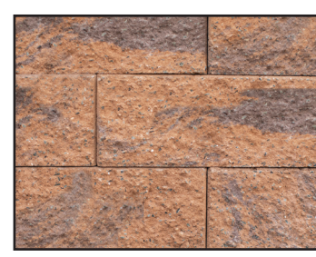
GOLDEN BROWN BLEND