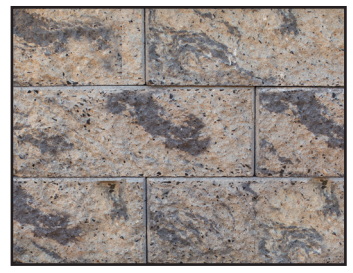
GRANITE CITY BLEND