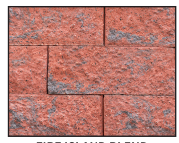
FIRE ISLAND BLEND