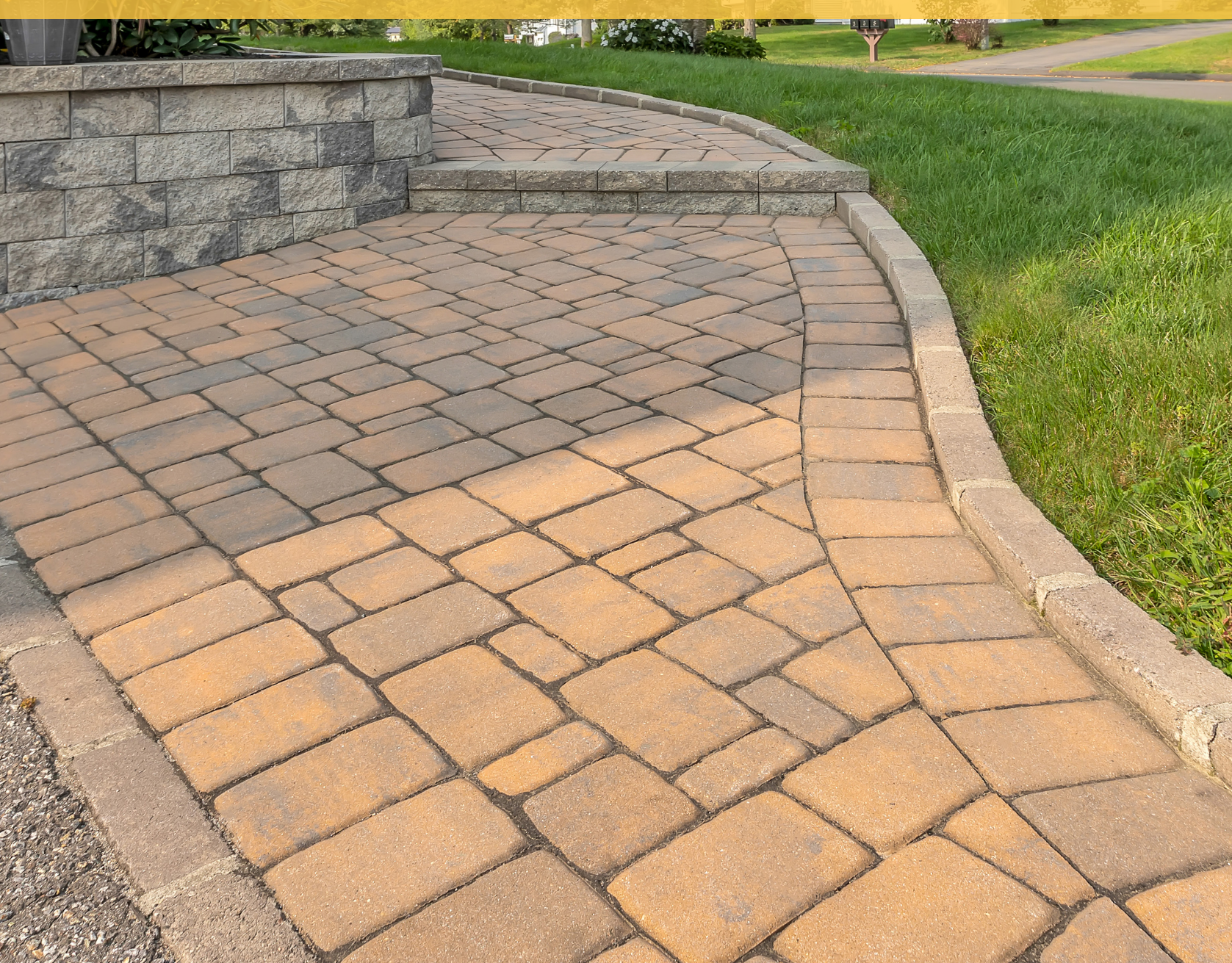
Colonial Cobble 4 Pc Combo | Color: Adobe Blend

paver-shield <sup>™</sup> has a tight, smooth surface texture and will not expose heavy aggregate as it wears. Ultra-dense surface has more color and more protection. Nicolock has color from top to bottom throughout the paver ensuring a lifetime of beauty. Iron oxide pigments are guaranteed not to fade!