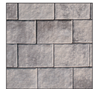
Granite City Blend