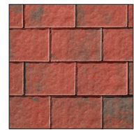
Fire Island Blend