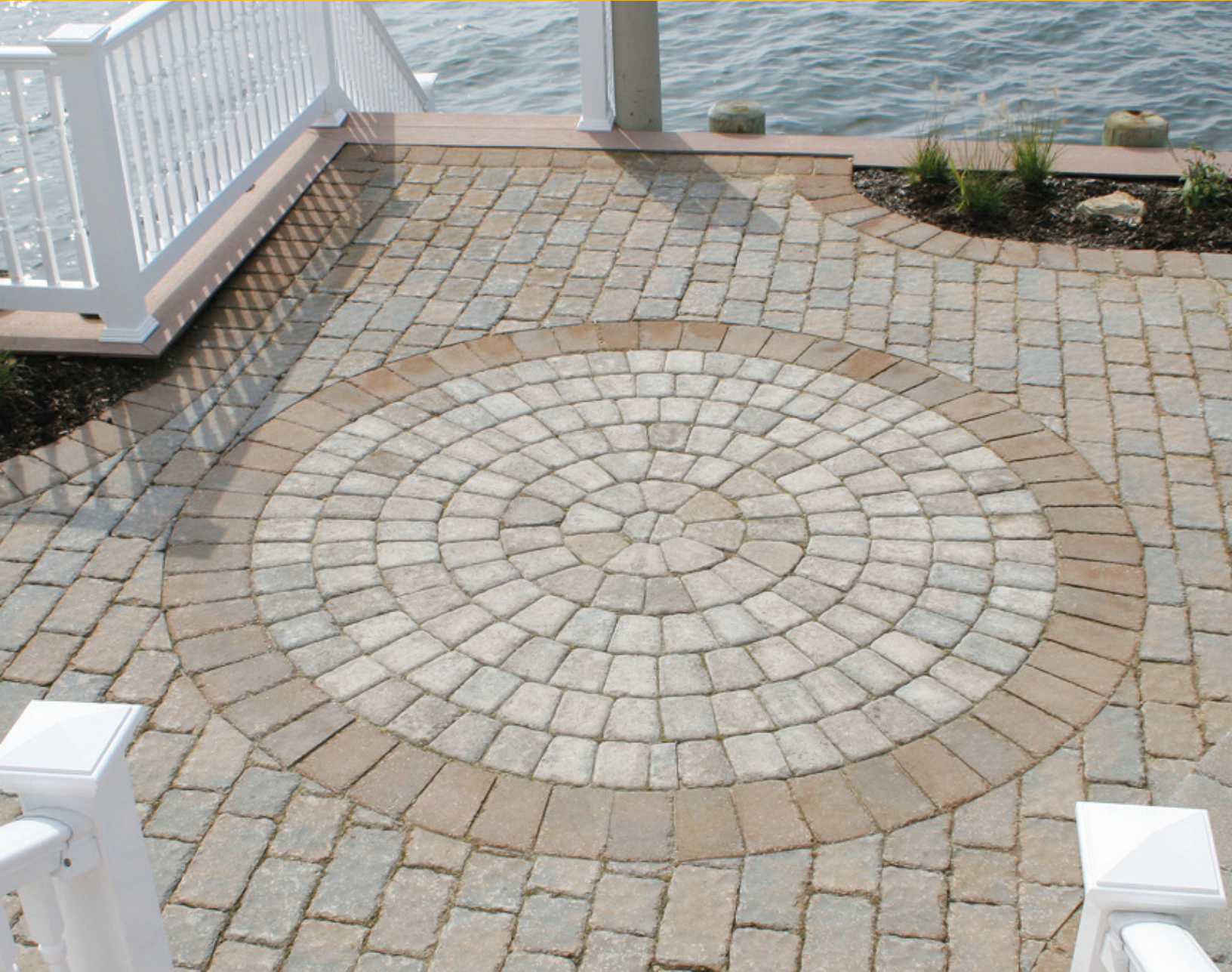
Country Circle | Color: Granite City Blend

paver-shield™ has a tight, smooth surface texture and will not expose heavy aggregate as it wears. Ultra-dense surface has more color and more protection. Nicolock has color from top to bottom throughout the paver ensuring a lifetime of beauty. Iron oxide pigments are guaranteed not to fade!