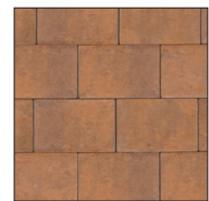
Golden Brown Blend