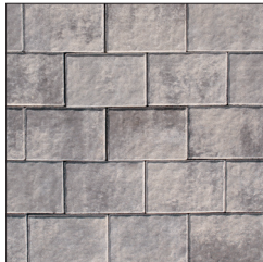
Granite City Blend