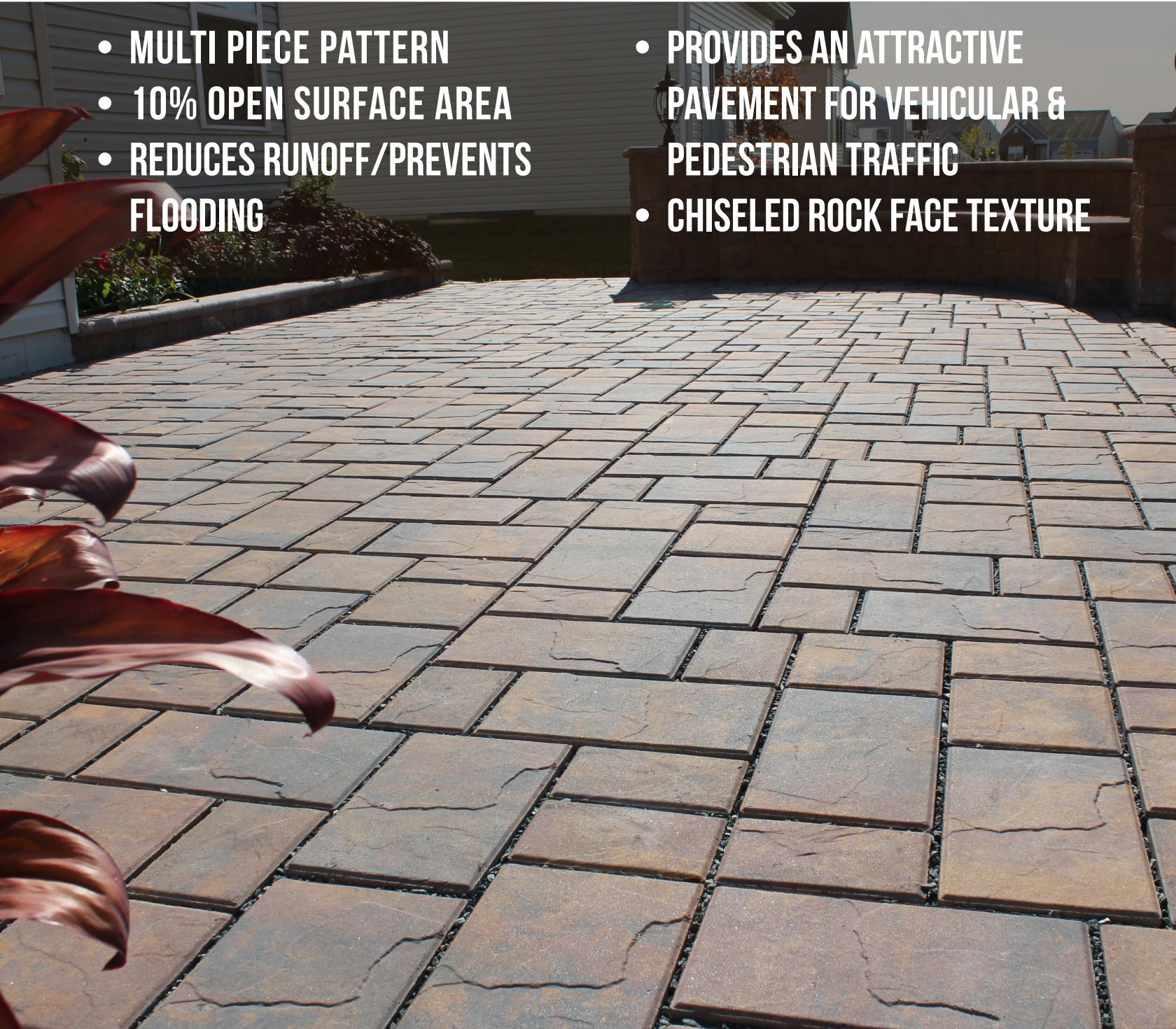
Eco-Tre | Color: Oyster Blend