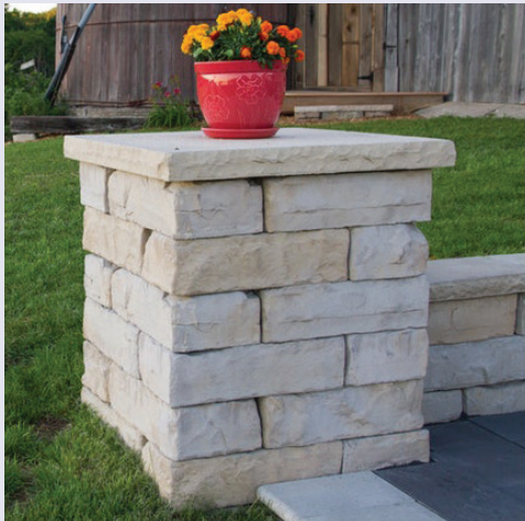
Kodah Pier | Color: Gironde (special order)

Corner blocks are used to build the pier. Multiple textures provide a random look for your finished project. Cap provides the finishing touch as well as additional lighting possibilities.