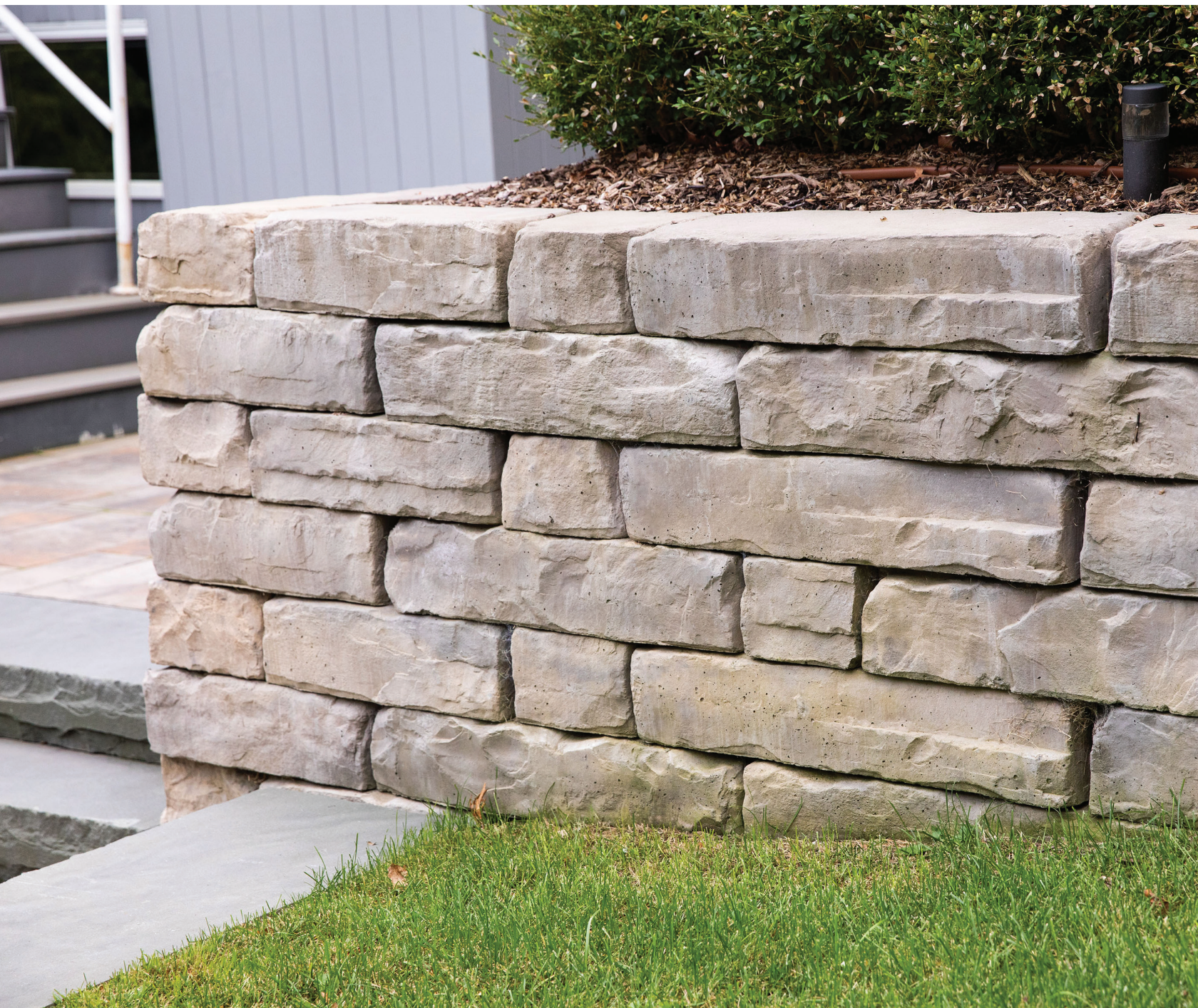
Kodah Wall | Color: York Brown