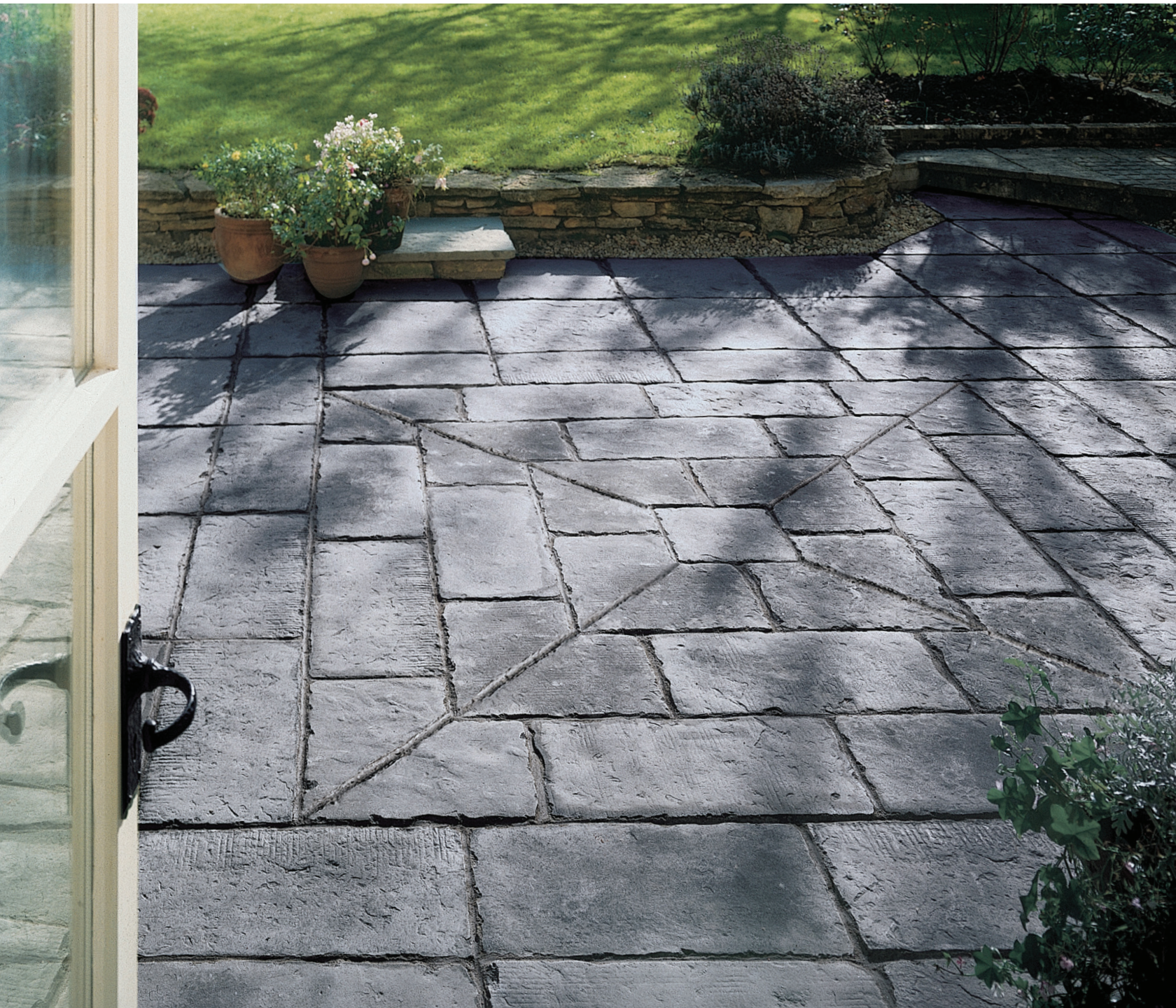
Old Town Flagstone Quartered Square | Color: Bluestone