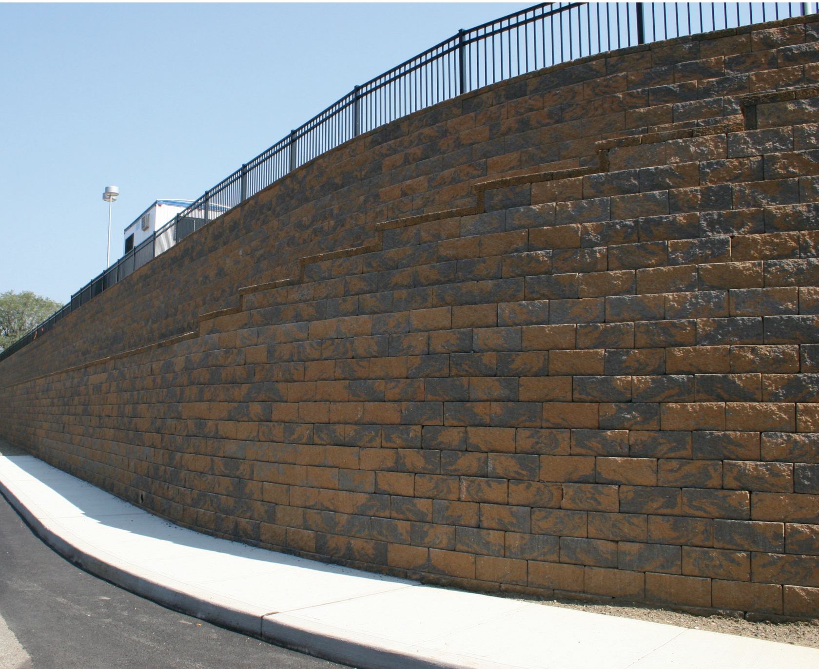
Trinity® Wall | Color: Adobe Blend