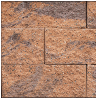
Golden Brown Blend